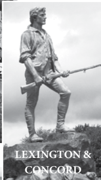
LEXINGTON & CONCORD